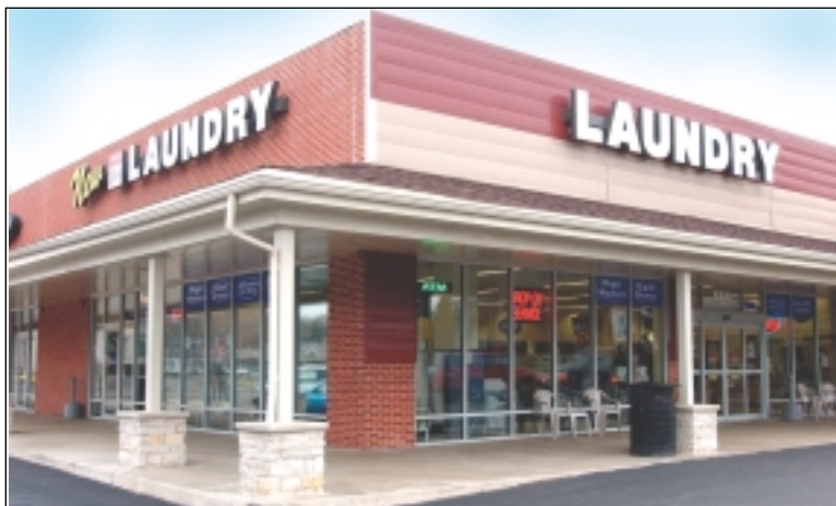
Fox Lake Laundromat is located in Fox Lake, Illinois, features 54 large commercial dryers that require up to 20,000 CFM of make up air.

A laundromat contractor and an equipment distributor teamed up to design a unique mechanical system for a new facility. The system provides up to 20,000 CFM of make-up air for 54 large commercial dryers from two four-square-foot roof openings. The brains of the system is a Tjernlund CPC-3 Constant Pressure Controller. It senses room pressure and automatically adjusts two roof-mounted modulating fans to deliver the amount of air needed by the dryers when they are operating. Multiple benefits for the owner include reduced construction costs, fewer roof penetrations, increased interior comfort for customers and expected energy savings. The system has been operating successfully since May 2005.