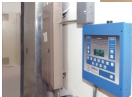
Above: Tjernlund's CPC-3 Constant Pressure Controller senses room pressure and adjusts modulating roof mounted blowers to deliver volume of make up air required by dryers in operation.